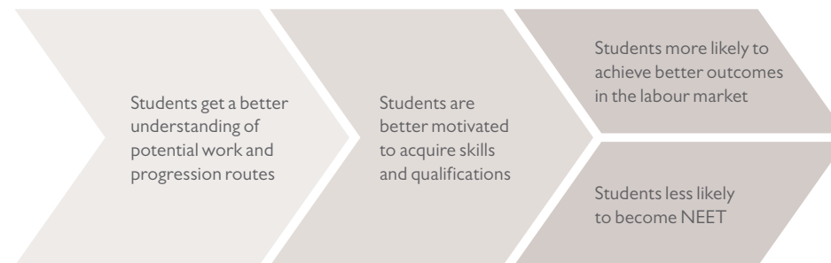
Figure 3: PwC's impact pathway